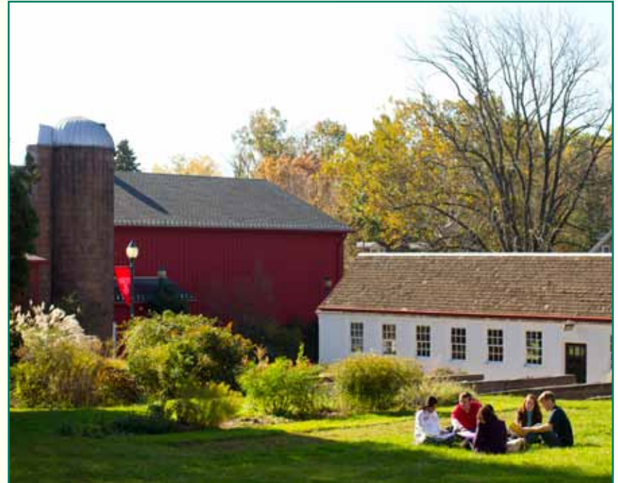
Students studying near the original Head House, site of the future Visitors' Center

The Arboretum is an historic site of horticulture, agriculture and design, within an institution of higher learning. It serves as a living laboratory for students and the community, focusing on sustainability, the health benefits of gardens, and the history of women in horticulture, agriculture and design.