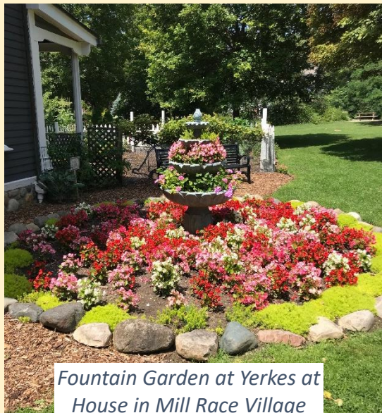
Fountain Garden at Yerkes at House in Mill Race Village

Submitted by Dana Whelan Photos by Dana Whelan