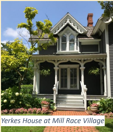
Yerkes House at Mill Race Village