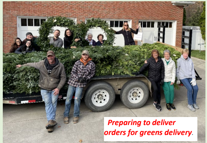
Preparing to deliver orders for greens delivery.