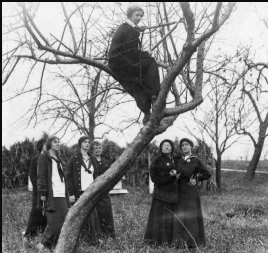
Class of 1913