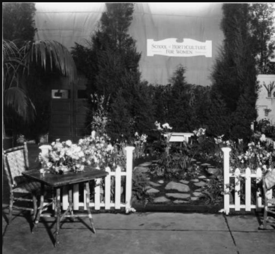
1932 Flower Show Exhibit